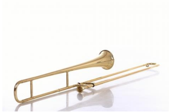
Sackbut (Trombone) or an ancient string instrument