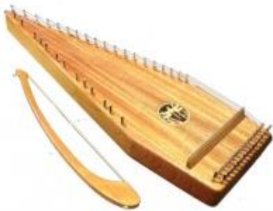
Psaltery (harp like instrument) (violin)