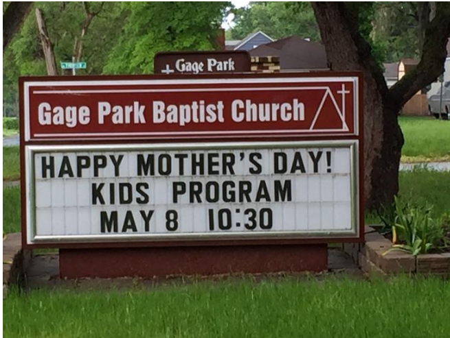
Gage Park Baptist, Topeka