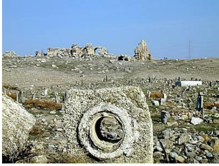
Aqueduct Found at Laodicea I

Laodicea was a primary hub for the Roman aqueduct system. The Romans were famous for their aqueducts where they would supply cities with fresh water for public baths and fountains. The water that was piped to Laodicea was rich with calcium which over time would cause the pipes to clog. The engineers designed the aqueduct with vents covered with stones that could be removed periodically for cleaning. Laodicea was a few miles from a hot spring.