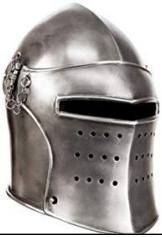
Hope of Salvation

Cor. 5:14 – For the love of Christ constraineth us. Col. 3:14 And above all these things put on charity, which is the bond of perfectness. Col 2:2 That their hearts might be comforted, being knit together in love, and unto all riches of the full assurance of understanding, to the acknowledgement of the mystery of God, and of the Father, and of Christ. Eph. 4:1-3 I therefore... of the Lord, beseech you that ye walk worthy of the vocation wherewith ye are called, With all lowliness and meekness, with longsuffering, forbearing one another in love; Endeavouring to keep the unity of the Spirit in the bond of peace.